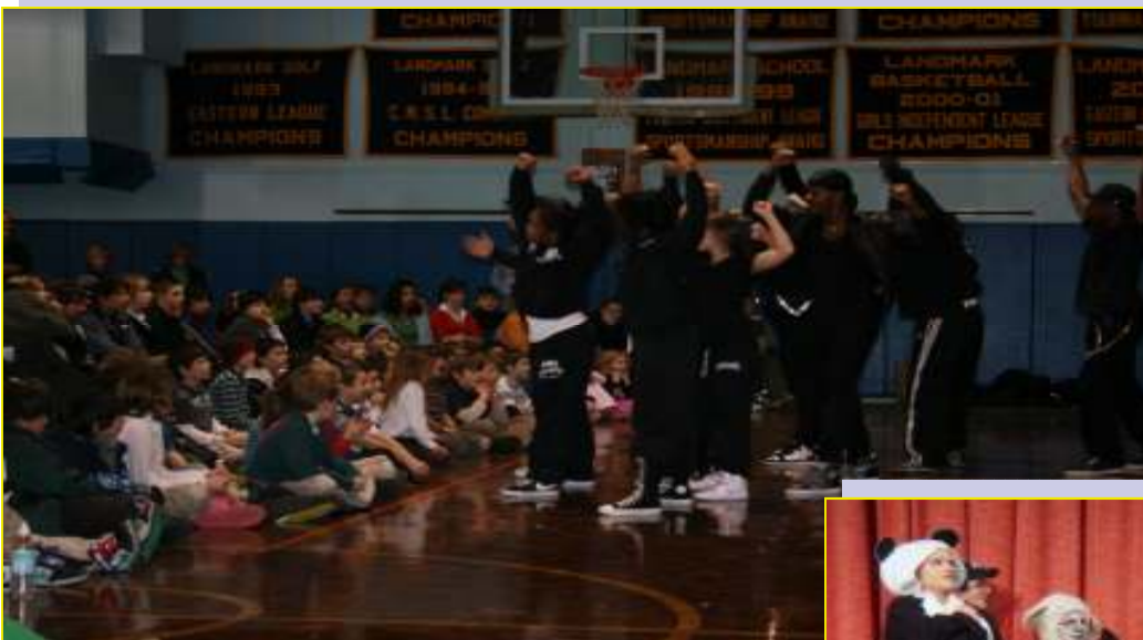
Cultural Enrichment: Phunk Phenomenon Performance at EMS

The remaining money went towards our expenses and the reserve funds.