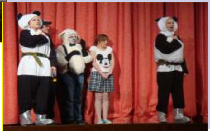
HS Performing Arts: "Revenge of the Space Pandas"